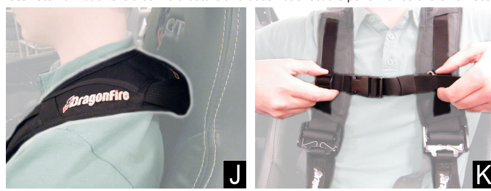
Step 16: This completes installation. Time to ride and enjoy.

Note: Sternum buckle is a comfort feature and does not effect the performance of the harness.