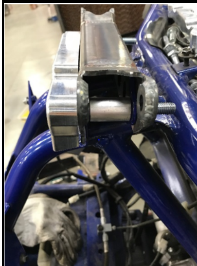
Figure 4: M10 bolts through front saddle, spacers, and through the other side.