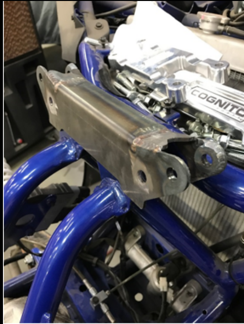
Figure 3: Cognito shock tower over OEM Tower.