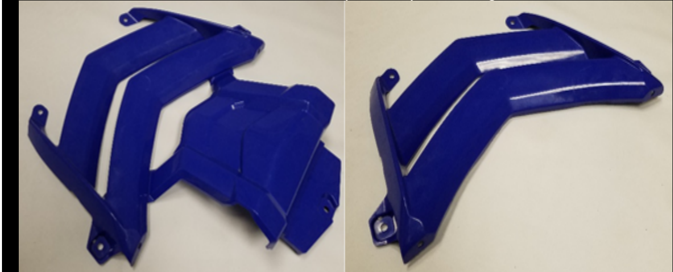
Figure 9: Finned hood before and after trimming