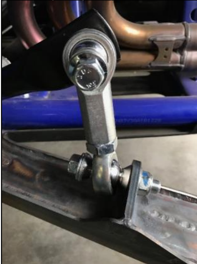
Figure 1: Cognito sway bar end links.