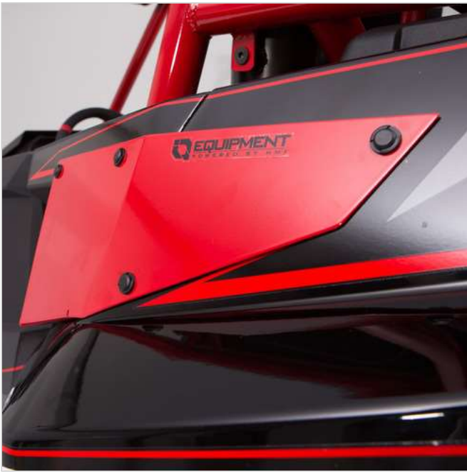
(10) Plastic Push Rivet