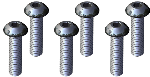
M5x20 Button FT Screws (6pcs)