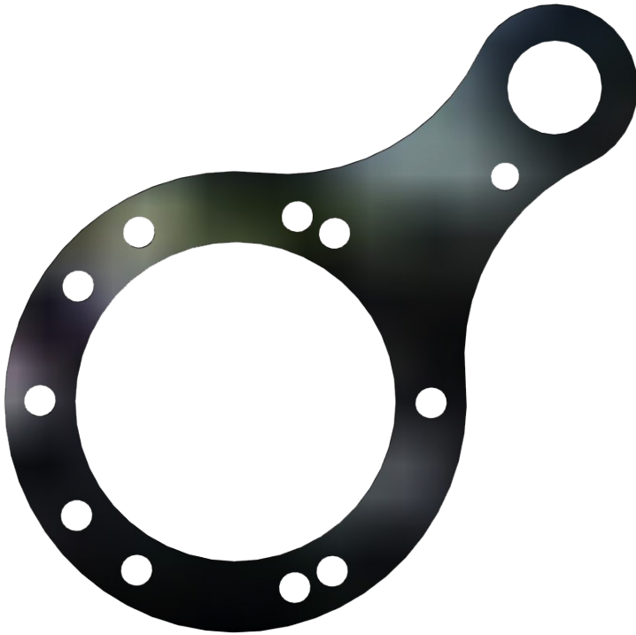
Push To Talk Plate, 5/6 Bolt Pattern