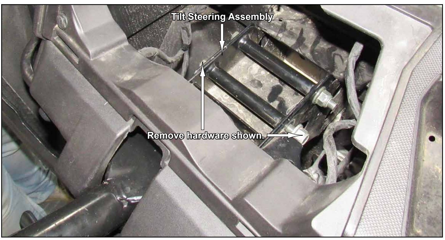
Remove Lower Dash.