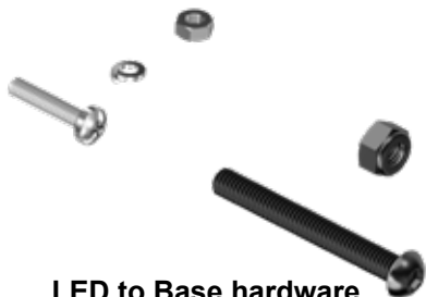
LED to Base hardware