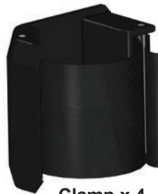
Clamp x 4